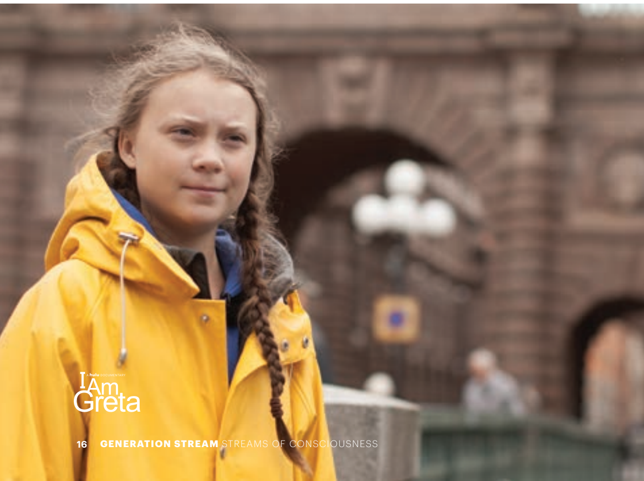
The Hulu Original documentary, I Am Greta , follows teenage climate activist Greta Thunberg in her moving fight to end climate change.

Harvey Weinstein scandal, giving a voice to Weinstein’s former colleagues and victims. A different class of teen celebrity is also creating their own activist content—TikTok stars. With brutal memes that reflect Z’s dark humor, the teens of TikTok have turned their micro-video expertise toward school shootings, showing the frustration and anxiety of a generation shaped by gun violence. Even dating has gotten #woke: according to Tinder’s 2019 Year in Swipe report, users between the ages of 18 and 24—which makes up the majority of the app’s users—were 66% more likely than millennials to mention issues like climate change, gun control, or social justice in their bios. ▶